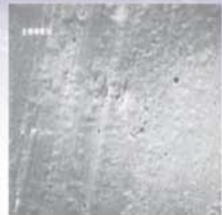
The bearing is visibly smoother after using Royal Purple HPS.

HPS 5W-20 12 QT Case: 32520 QT Bottle: 31520