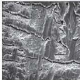
The bearing is scuffed after using a leading synthetic motor oil.